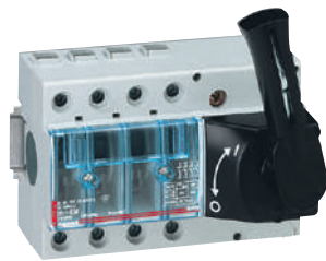
0 225 15

Safety switches for on-load circuit breaking by visible isolation of the contacts Double break type load switching with self cleaning contacts by rapid make and break movements Fixing on rail EN 60715 or screw fixing (only on rail for Vistop 63 A) Padlockable handle in open position: 1 to 3 padlocks Cat.No 0 227 97 (p. 73) 2 versions for mounting on faceplate: • right side handle, supplied with seal to maintain the IP protection for the enclosures (up to IP 55), screws, self adhesive drilling template, extension rod (30 to 170 mm) for creating an external angle • direct front handle or external (for Vistop 63 to 160 A)