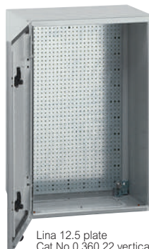
Lina 12.5 plate Cat.No 0 360 22 vertical mounting inside Atlantic enclosure Cat.No 0 369 26