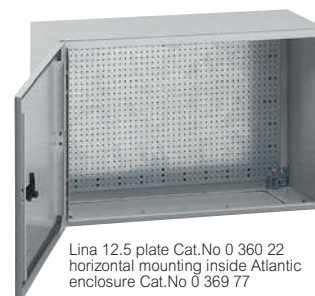
Lina 12.5 plate Cat.No 0 360 22 horizontal mounting inside Atlantic enclosure Cat.No 0 369 77

Cabinet and equipment selection chart p. 288 Technical characteristics p. 304